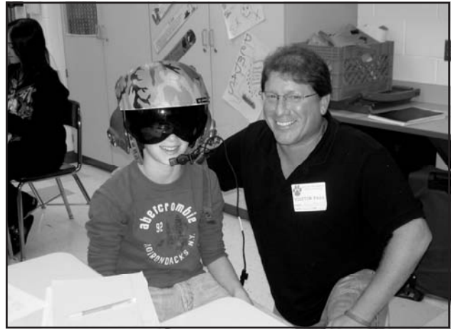
Mount Arlington's Veterans were honored this past Fall in our annual Veterans Day Celebration. Local residents from World War II through the Iraq War were honored by our students in Grades 3 through 8.