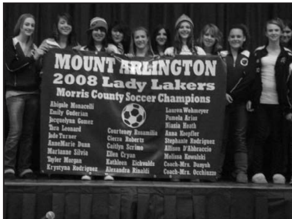
The Lady Lakers Soccer Team concluded a successful season by winning the district's first ever Group I Morris County Soccer Championship.